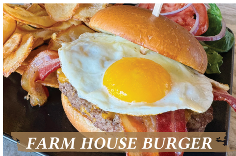
FARM HOUSE BURGER

*UPTOWN BURGER Our classic cheddar cheeseburger 13