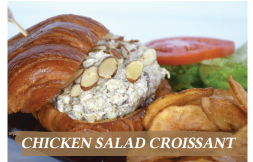
CHICKEN SALAD CROISSANT

CHICKEN BURRITO Grilled chicken, melted pepper jack cheese, tomato, onion, shredded greens and black bean relish. Housemade salsa roja and guacamole on the side 12.5